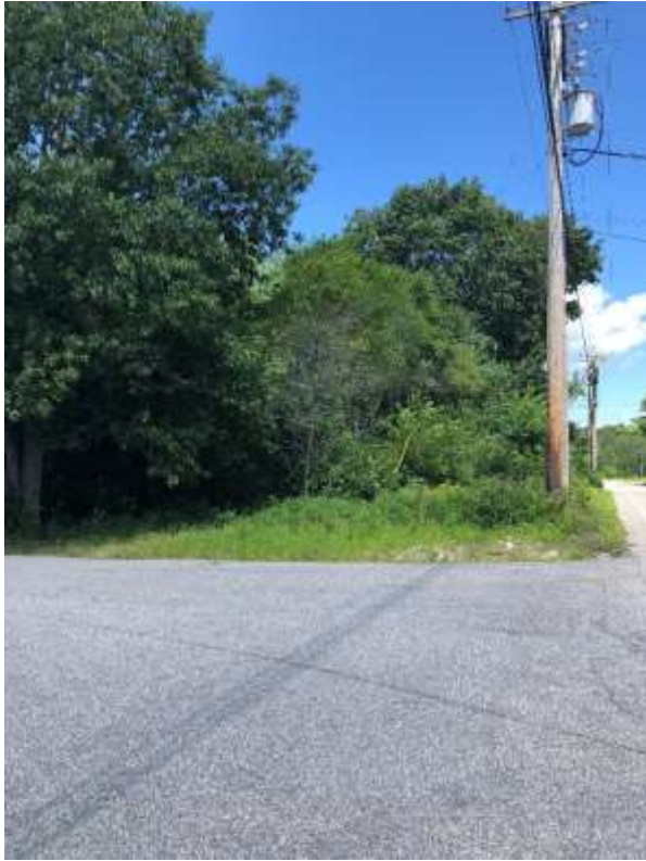
Pomerleau Street and Driveway Entrance Lot View